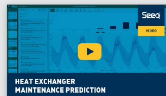
Video: Heat Exchanger Maintenance Prediction