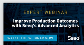
Webinar: Improve Production Outcomes with Seeq's Advanced Analytics